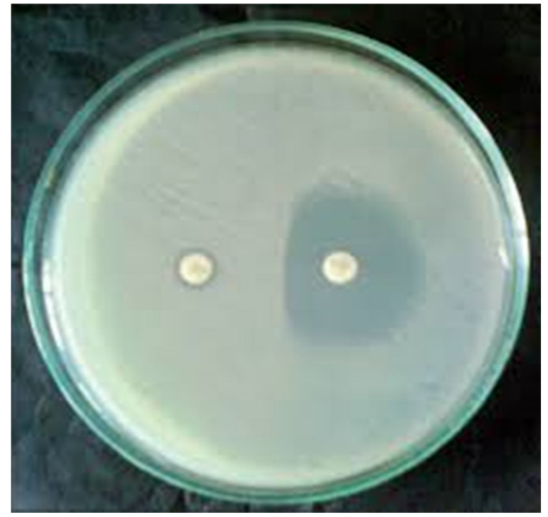
Fig-3: Picture showing oxacillin resistant and sensitive strain

ISSN: 2321-9653; IC Value: 45.98; SJ Impact Factor: 7.429 Volume 8 Issue VII July 2020- Available at www.ijraset.com