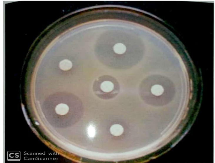
Fig:2 Photograph showing antimicrobial sensitivity on Muller-Hinton agar medium

The drug resistance pattern of clinical isolates showed resistance to two drugs in 3 (2.94%), three drags in 10 (9.8%) isolates, four drugs in 18 (17.65%) isolates, five or six drugs in 25 (24.51%)) isolates, seven or eight drugs in 16 (15.67%)) isolates whereas resistance to more than ten or more drugs was found in 30 (29.47%) isolates. No isolate was resistant to only one drug.