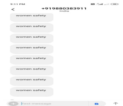
Fig. 6 SMS sent through GSM