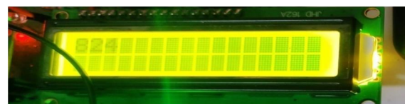
Fig. 5 LCD display sensor values image2