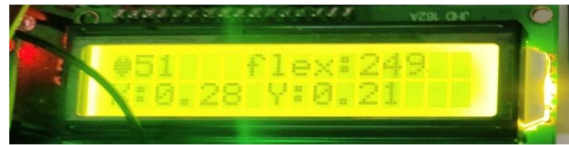
Fig. 4 LCD display sensor values image1

The following figures represent the LCD displaying values of all sensors of the proposed system.