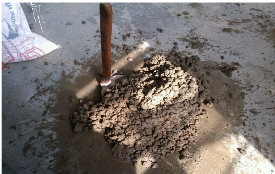
Figure 5: Preparation of material

All materials were brought to room temperature before commencing the results. The cement samples, on arrival at the laboratory, were thoroughly mixed dry either by hand in such a manner as to ensure the greatest possible blending and uniformity in the material, care is being taken to avoid the intrusion of foreign matter. The cement was stored in a dry place.