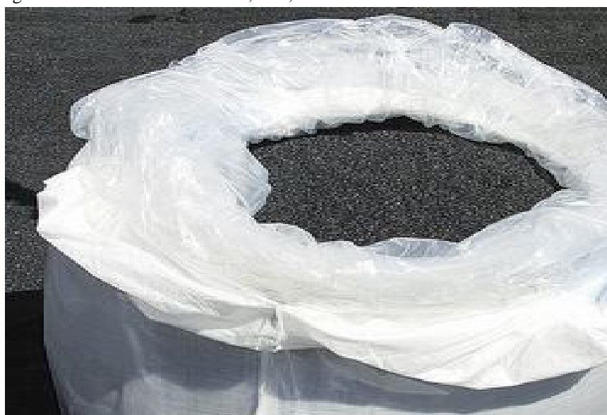
Figure 3: Copper slag