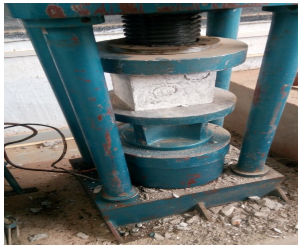
Fig 7- Compression testing machine

The compressive strength on each 150×150×150 Cubic specimen was determined in accordance with Compression testing machine. The two ends of each specimen were ground before testing to ensure uniform distribution of load during test. The diameter of each specimen was taken before the compressive strength test. The testing was hydraulic controlled with a maximum capacity of 2000 KN. Load was applied to the specimen at a constant loading rate of 0.5 N until complete failure occurred. The outputs of the load cell from the testing machine were connected to a data acquisition system, which records the data during the test. The maximum load is recorded and the compressive stress computed by dividing the maximum load by the cross sectional area of the specimen. The type of fracture was also recorded.