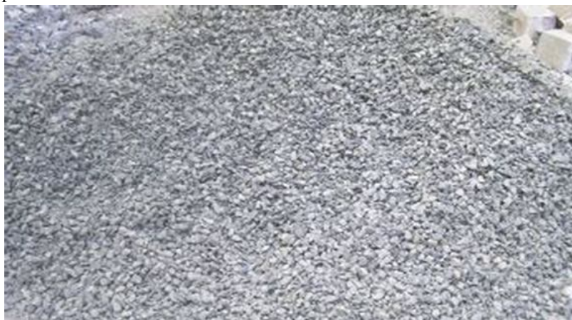
Figure 3 - Coarse aggregate