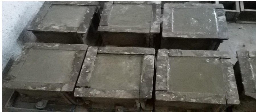
Figure 6: Casting of Concrete

First of all, lubricating oil is applied to all the moulds so that during opening time after 24 hrs will open mould easily without damaging the concrete cube and before pouring ensures that all the bolts of cubes are tight, this prevents the leakage of concrete mix and help in setting of perfect cube shape (150 mm × 150 mm × 150 mm). The concrete mix of M-20, grade was designed to. All the concrete mixes were mixed in Institute laboratory. From each mix three 150 mm cubes were cast for determination of compressive strength, 100mm×100mm×700mm beam were cast for the determination of flexural strength.