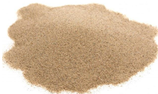
Figure 2: Fine Aggregate