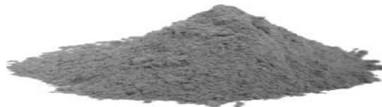
Figure 1. Cement