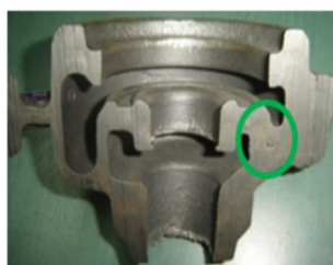
Fig1. Shrinkage Porosity in Actual Casting

The feeder dimensions have revised 40 mm bottom diameter and 65 mm height and analyzed for hot spot .After solidification simulation in Autocast soft hot spot shifted in feeder side result in elimination of internal shrinkage .(E-Foundry, n.d.)