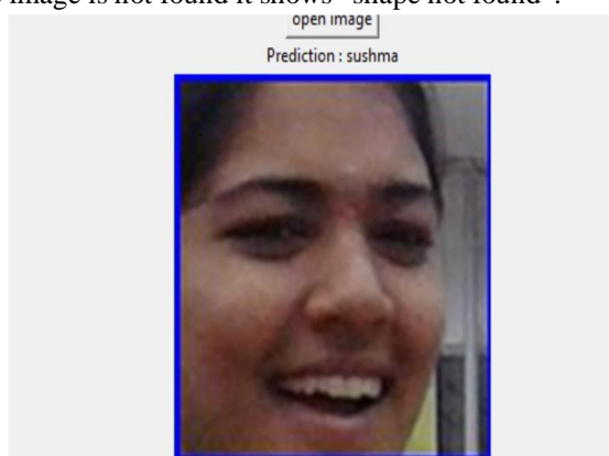
Figure 2: The Predicted image of a user

The produced system is related with an easy to understand site where client will transfer photograph for identification purpose and it gives the desired output. The proposed CNN system deals with the standard dependent on detection of a part and removing CNN features from different convolutional layers. These features are totaled and afterward given to the classifier for classification reason. Here the proposed system collects data using web cameras in different angles and positions to build the system to produce good accuracy. If the image is found then the accuracy is predicted and also indexes are displayed as 0 or 1 based on the image given from either test set or training set, if the image is not found it shows "shape not found".