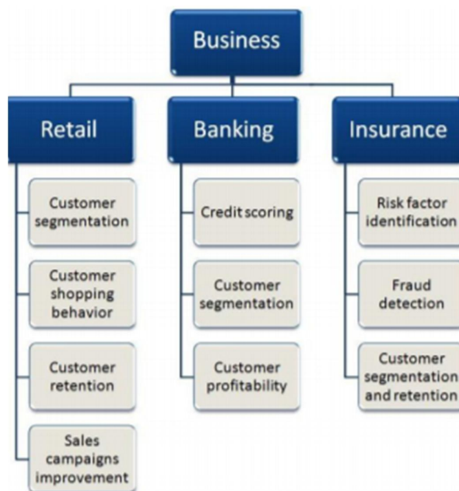
Fig.. I. EXPLORIN and Growing Advances:

Fig-I depicts the means of information quality to be practiced to have appropriate and liberated from information quality elements which are portrayed in the coming areas individual needs to ace how to break down fiscal summaries successfully. On the off chance that you are one of them, at that point follow these six stages to assist you with building a powerful budget report examination: