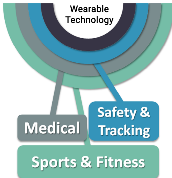
Fig. 3. Domains of wearable technology

So far, we have discussed the user requirements and various components of IoT-enabled smart wearable devices. In this section we will discuss about the major domains in which wearables are used and recent innovations in these domains. The three major domains are i) safety and tracking, ii) medical, iii) sports and fitness [Fig. 3].