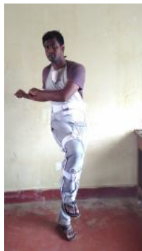
h) Upper trunk and lower body opposite twist(8=h)