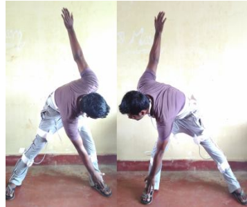
f) Waist bend (reach foot with opposite hand)(6=f)