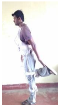
j) Heels (alternatively) to the back side(10=j)