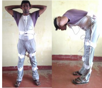
e) Waist bend forward (5=e)