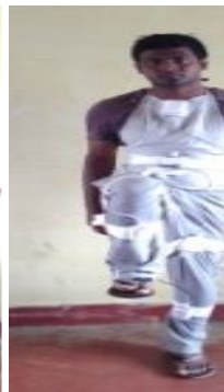
i) Knees (alternatively) to the chest(9=i)