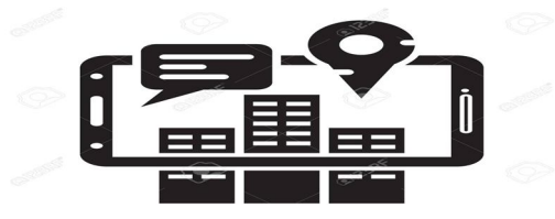
Fig 1. Web-based Augmented Reality