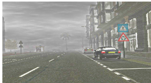
Fig4: Output haze free image using WCID algorithm