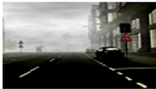
Fig 3: output haze free image using DCP algorithm