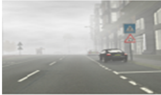
Fig2:input hazy image

effective image restoration technique for images captured in wide range of weather conditions.