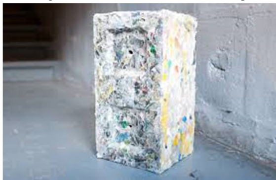
Fig 2- Brick specimen made up of waste plastic.

Beside from the application of plastic wastes for construction purposes, there are other products that have been developed for general engineering and indoor use[1].