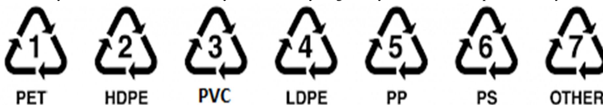
Fig 2- Symbols For Resin Identification Code.

Every plastic container contains the ‘resin identification code’ (RIC) which contains numbers ranging from 1 to 7 in a triangle that indicates its suitability to recycle the plastic used. These symbols indicate the chemical constituents, toxicity, and the possibility of leaching. The major materials classified under these numbers are: (1) Polyethylene Terephthalate (PET), (2) High-Density Polyethylene (HDPE), (3) Poly Vinyl Chloride (PVC), (4) Low Density Polyethylene (LDPE), (5) Polypropylene (PP), (6) Polystyrene, and (7) other miscellaneous resins including polycarbonate. While plastic with symbols 1, 2, 4, and 5 can be safely recycled, those with symbols 3, 6 and 7 are relatively unsafe for recycling; it may be noted that the plastic with symbol 7 is unsafe.