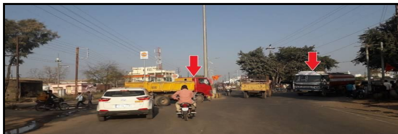
Figure 2:- uncontrolled intersection at bhairav mandir square

Road Deficiencies Analysis As per the guidelines given in the standard checklist (IRC: SP: 80:2010) the following major road deficiencies were observed at the identified road stretch.