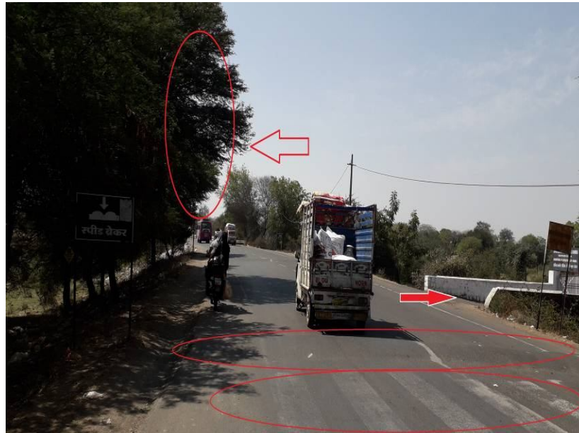
Figure 3:- Sight distance, Faded marking and Non-engineered speed breaker in front of Sophia convent school

B. Figure 3 showed that the obstruction to line of sight insufficient sight distance due to occupation of trees. The sight distance along the road is inadequate or restricted when plantation on the edges of embankments. Obstruct the sightlines to stationary objects or oncoming vehicles. Although zebra marking for Pedestrian crossing was present at the site but due to poor maintenance it was faded and was not clearly visible. No proper sign board for Pedestrian crossing was present near the zebra crossing. Presence of speed-breakers indicates that these places are hazardous and lacks appropriate engineering measures. In Front of Sophia Convent School & Kishore Kumar Samarak and Crematorium Khandwa speed-breaker are not marked or poorly marked and contributing to accidents of different natures. Speed-breakers and raised pedestrian crossings are either not painted or poorly painted with white colour, thus posing surprise situations to drivers at night.