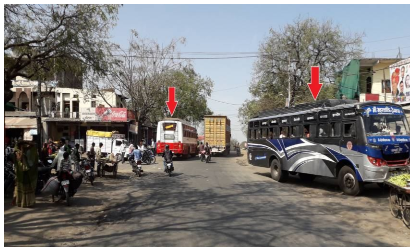
Figure8:- Bus stops on the shoulders of the highway at Deshgaon