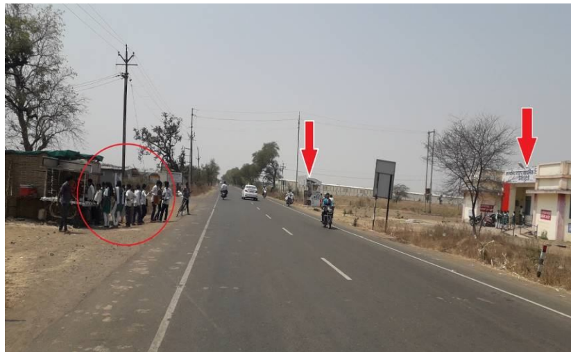
Figure 4:- No signs boards, road markings and speed breaker In Front of Govt.School Takali Mori (Chhegaon Devi)

B. Figure 3 showed that the obstruction to line of sight insufficient sight distance due to occupation of trees. The sight distance along the road is inadequate or restricted when plantation on the edges of embankments. Obstruct the sightlines to stationary objects or oncoming vehicles. Although zebra marking for Pedestrian crossing was present at the site but due to poor maintenance it was faded and was not clearly visible. No proper sign board for Pedestrian crossing was present near the zebra crossing. Presence of speed-breakers indicates that these places are hazardous and lacks appropriate engineering measures. In Front of Sophia Convent School & Kishore Kumar Samarak and Crematorium Khandwa speed-breaker are not marked or poorly marked and contributing to accidents of different natures. Speed-breakers and raised pedestrian crossings are either not painted or poorly painted with white colour, thus posing surprise situations to drivers at night.