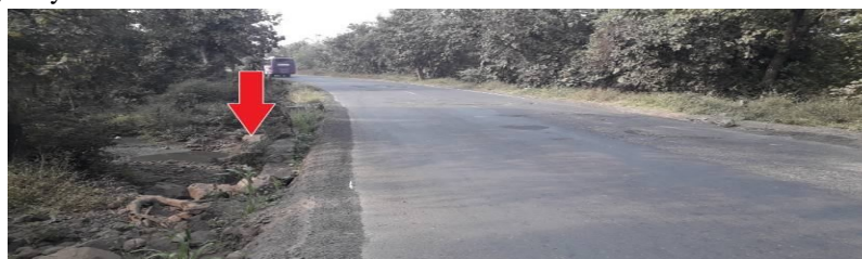
Figure 9:-Formation width is eroded due to excess rainfall.