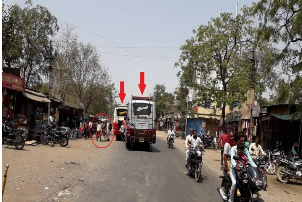
Figure 5:- Passenger boarding and alighting, bus stops on the carriageway of the highway at chhegaon Makhan (kherda village)