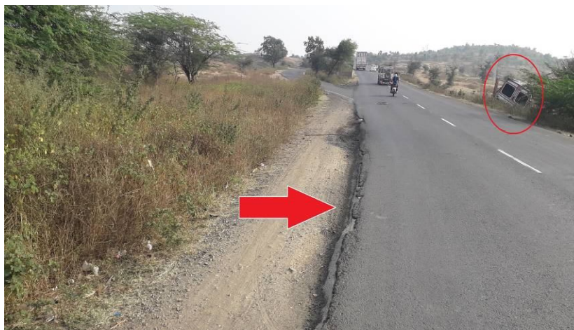
Figure 7:-Improper shoulders at ghat section between Chhegoan Makhan (Kherda village) To Roshiya