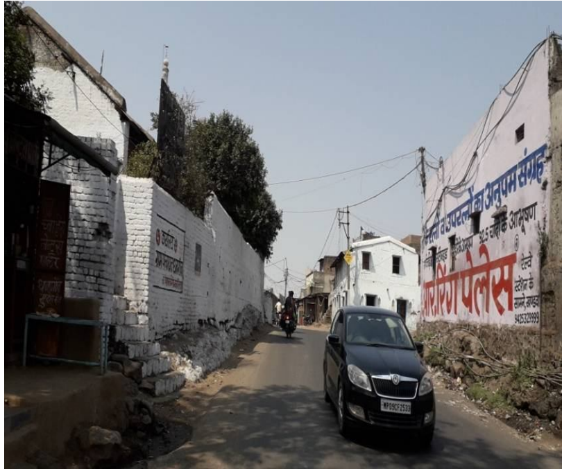
Figure 13:- Shoulder, carriageway width & sight distance due to occupation of wall at dhangoan