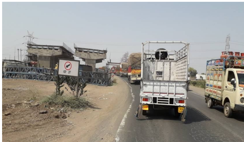
Figure 14:- By having construction of bridge and broad gauge railway on these path problems of traffic jams is raised frequently