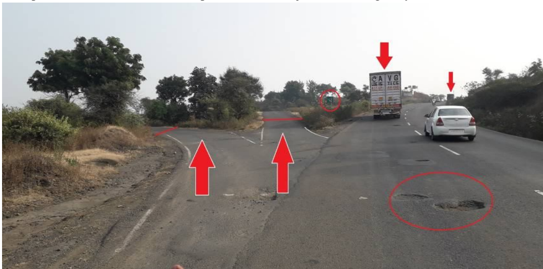
Figure 6:- Heavy trucks do not follow diversion road and rule & regulations and potholes at ghat section between Chhegaon Makhan (Kherda village) To Roshiya