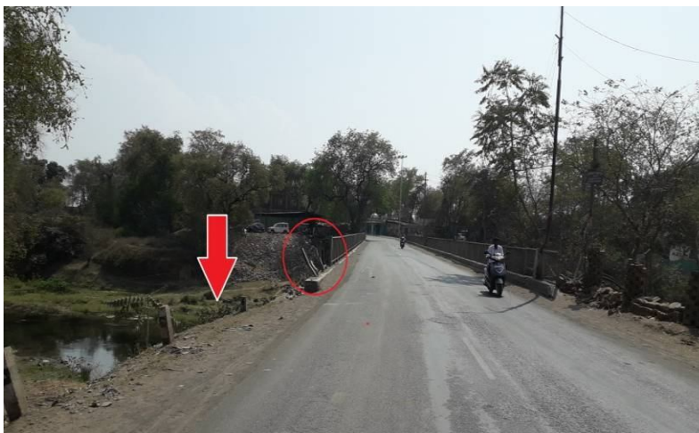
Figure 15:- Guardrails are broken at Sanawad Bridge