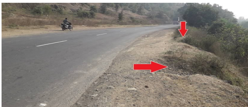
Figure 12:-Unguarded deep valley