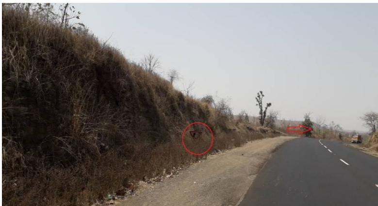
Figure 10:-Sign board direction changed due to wind force or hit by any vehicle