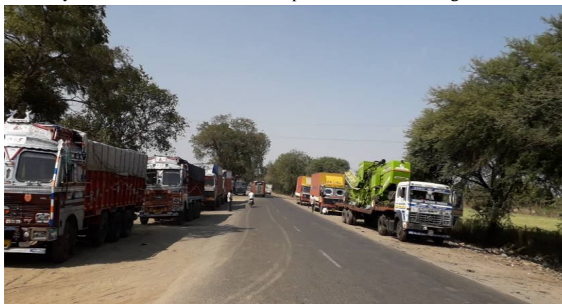
Figure 11:-Provision for Heavy Vehicles