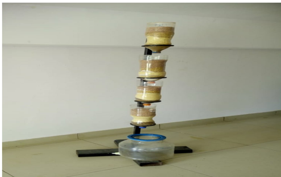
Figure 1: Experimental model