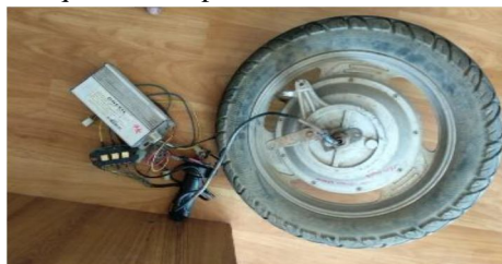
Fig 1: BLDC Hub Motor attached at front wheel

Hub motors are beneficially important equipment needed in the development of Hybrid System as they offer several benefits such as compactness, noiseless operation and high efficiency for electric vehicles. These motors have stators fixed at the axle, with a permanent magnet rotor embedded in the wheel. BLDC motor is a closed loop synchronous motor. They have an array of permanent magnets on inside surface. They provide high torque at low Rpm.