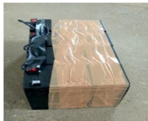
Fig 2: Lead Acid batteries arrangements