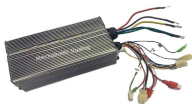
Fig 3: Controller

The controller controls the speed and torque of the motor. The controller connects the power source –fuel cell or battery to the actual motor. It controls speed and direction and optimizes energy conversion. While batteries produce a fairly constant voltage which decreases as they are used up, we need electronic controlled unit attached to the BLDC motor to determine the position of the rotor and to energize the coils accordingly