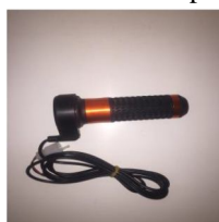
Fig 4: Resistor

It works as a throttle substance for the motor from it we can control the speed of the vehicle.