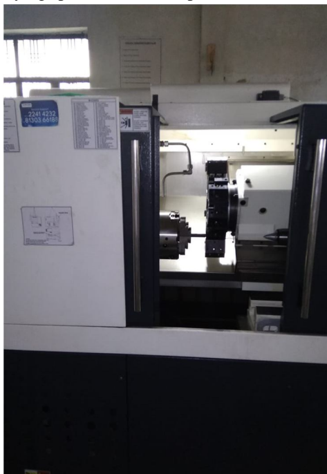
Fig. 1: ACE CNC Turning Machine

The present investigation is performed by varying speed, feed and depth of cut so as to analyze the MRR and surface roughness.