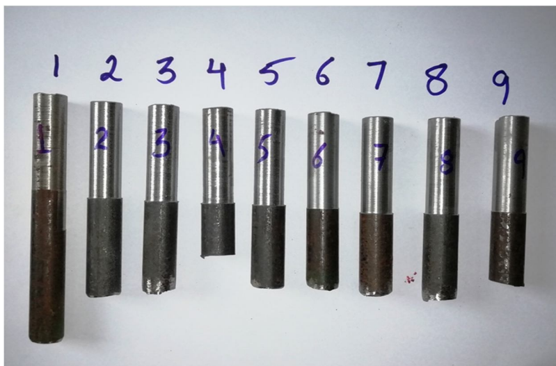
Fig. 2: Plain Turning machined Specimens