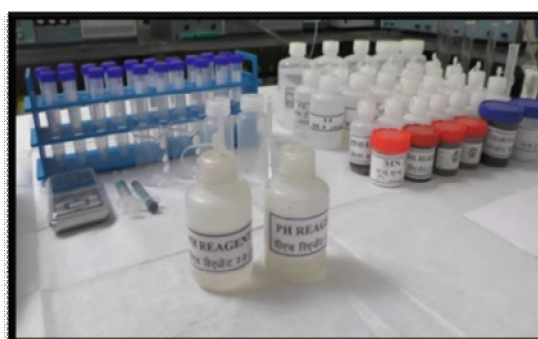
f. Chemical reagents and Glass apparatus