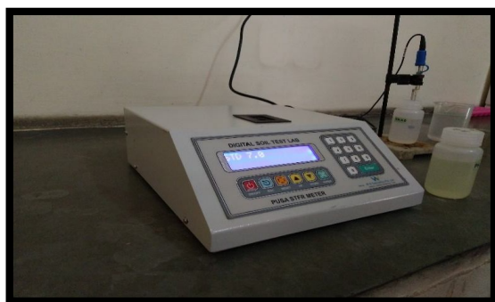
e. STFR Meter