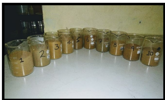
c. Soil Samples