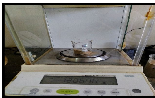
d. Weighing Machine