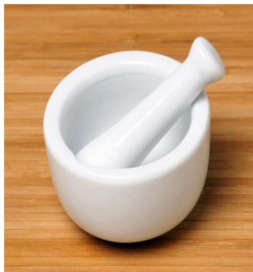
A .Grinding with Mortar and Pestle