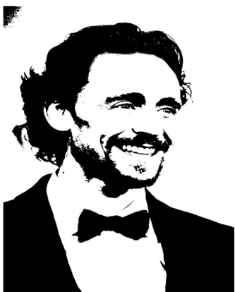
Fig. 2 B/W Intermediate Image