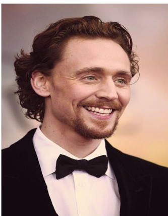
Fig. 1 Input Image