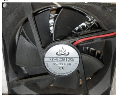
Fig 2.3 exhaust fan

It is additionally wont to take away wetness out of a space. It helps to get rid of any odors. the first purpose of the fan is to manage the inside surroundings by discharging out smoke and different contaminants that are gift within the air. It is often integrated into a cooling or heating plant. It disperses the air harmlessly. It are often utilized in summers to push heat air out for temperature dominant. It are often used as another for cooling.