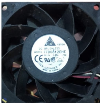
Fig 2.2 blower fan

The blower fan is additionally mentioned as centrifugal fan. A centrifugal fan may be a computer for diffusible air or different gases at orientation to the incoming fluid. Centrifugal fans typically carry a ducted housing to direct outgoing air during a particular direction, such an admirer is additionally mentioned as a blower fan.