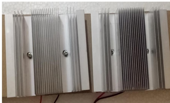
Fig 2.5 heat sink

It is a passive device that transfers the warmth made by any electronic devices to air or liquid medium to take care of a relentless temperature throughout. it's largely used with high-powered semiconductor devices that has low cooling ability. it's created from copper or metal.