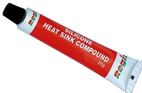
Fig 2.6 heat sink compound

It is used to fill the space. Heat sink compound is designed in such a way that it can accurately transfer heat to heat dissipating device from the heat generating component.