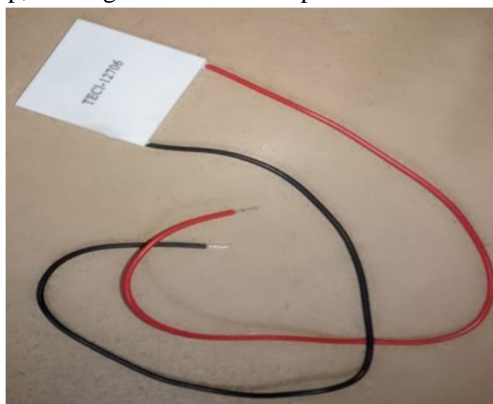
Fig 2.1 thermo electric module

A thermoelectric module, additionally known as a thermoelectric cooler or Peltier cooler, could be a semiconductor-based electronic component that functions as a tiny low setup, moving heat from one aspect of the device to the opposite.