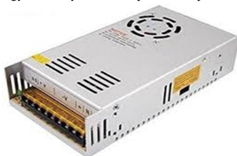
Fig 2.4 switch mode power supply

By this manner, it minimizes the wasted energy. in theory, there's no power dissipation within the switched mode power provide.