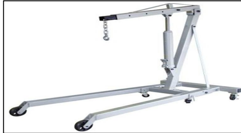
Figure 6: OTC Folding Floor Crane

It has the capacity of 4000lbs. This lifter is perfect for lifting any average vehicle like a low-cost car, sedan, or truck, with an ideal capacity of two tonnes. The low-profile rollers are suitable for traveling underneath the low-height cars. With a strong range of heights and a telescoping boom, it gives you the flexibility to remove motors, whether a small car like Honda S200 or a big car like a Cherokee jeep. The construction is exceptionally strong with clean welding and alignment.