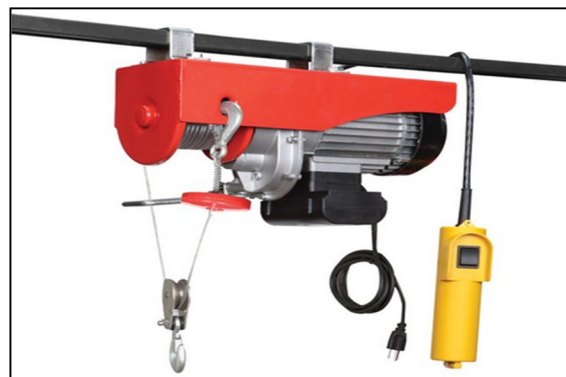
Figure 2: Electric Hoist

The electric hoist may not be so popular with elevators because other objects are to be lifted. In places such as scimills, shops, and different factories these hoists are particularly common. They are also used at car service stations to carry heavier loads and carry them too heavy to carry human beings. Electric hoist will operate completely automatically as opposed to hydraulic hoist or chain hoist. Thus, no manual force is required. In opposite to the hydraulic hoist where the operator has to pump the windscreen to raise the lifts boom or the chain stays, the electrical hoist operator has to control the raise with remote control, when the operator has to lift the lift [11] .