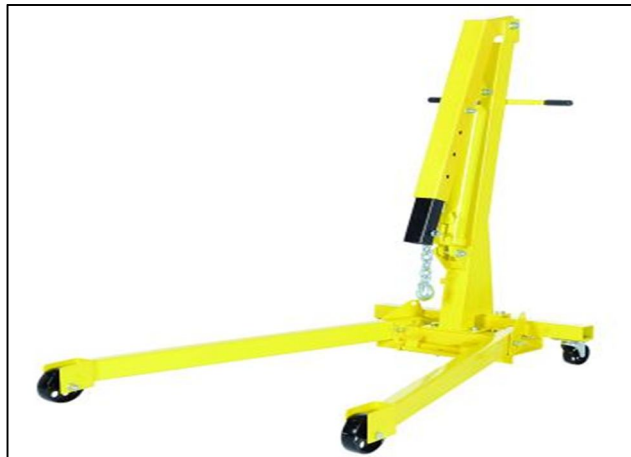
Figure 7: Vestal Shop Crane Engine Hoist with Folding Legs

It is compact and mainly designed to elevate engines. With the recovered bloom, this hoist has a capacity of 2000 lbs, which increments to 500 lbs with the increased boom. The telescoping boom also makes it possible to stretch the chain to make it easier without restricting its size, to reach your engine. This is enough for both small and medium-sized car engines. The solid steel building is highly durable. The pin that supports each leg can easily be removed to fold it [15, 16] .