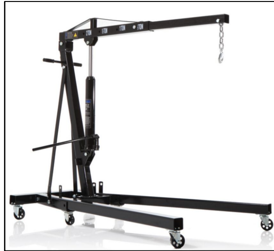
Figure 1: Hydraulic hoist

The hydraulic motor hoist is another tool in most car service stations. The engine hoist or engine lifter is responsible for the removal of the engine from the car. With the same idea as other hydraulic systems, a hydraulic engine hoist operates. It has got a hydraulic cylinder in the middle of the hoist, which can lift heavy loads. The engine is attached to the boom and can be lifted in the hydraulic cylinder by increasing pressure. This process is performed by a person who pumps a special winch on the base of the cylinder. This process raises oil pressure into the cylinder and that force can raise the engine hoists boom with a load that is attached to it. The entire lifting process of an engine can take a lot of time, so the hydraulic motor lift is not used as the quickest engine lift method. However, hydraulic engine hoists benefit enormously [9] .