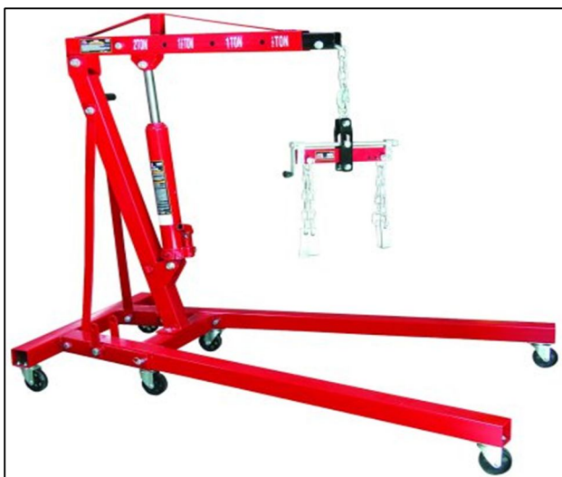
Figure 4: Torin foldable engine hoist

It is almost capable of everything but the biggest with a size of 2 tonnes. It has an additional foldable land. Even for close spacing of the garage, it is compact and storable enough. It also comes with a telescopic boom that can increase the hook over the motor. At the extending stage, which is indeed abundant for most vehicles, lifting ability will gradually fall to 1000 lbs. The lifting range is 1 "to 78/75" and is thus wider than that used to detach SUV motors or vehicles. The six wheels of this cherry picker have great versatility and stability [15] .