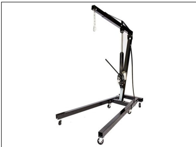
Figure 5: Wimmer Air Hydraulic Shop Crane Foldable Engine Motor Cherry Picker Hoist

It has a quick lift of 2 tonnes. For those with smaller garages, it is conveniently portable and storable. It makes things easier as it folds vertically so that when it is time for wrapping, its footprints are very small. It is fitted with an intelligent hydraulic system that offers users mechanical advantages to lift the hoist 6 times faster than other rotor cranes. It can save a lot of time because it pumps fewer cycles before the final removal of the engine when changing the height of the crane. The heavy-duty engine hoist manages most automakers and truck motors without problems at a size of 2 tonnes with the retracted four positions adjustable booms and 750lbs with fully expanded booms. The low-profile casters with a low minimum height often help for the mechanics [15] .