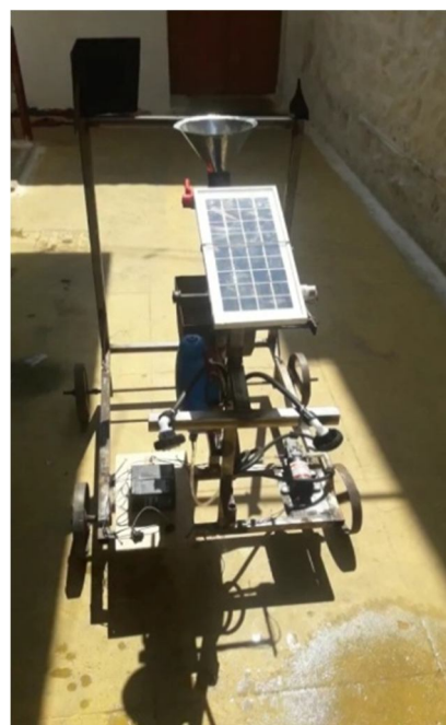
Fig. 2. Fabrication model.