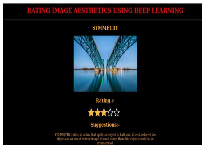
Fig 3. Classified and Rated Image