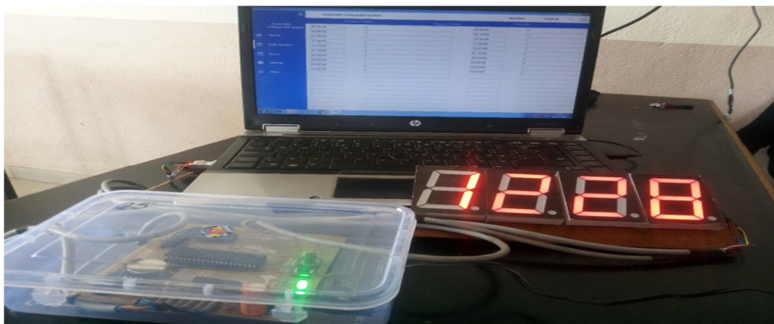
Fig. 8. Result