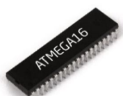
Fig. 2. ATmega16

Atmega16 may be a 40-pin low power microcontroller which is developed using CMOS technology. CMOS is a sophisticated technology which is principally used for developing integrated circuits. It comes with low power consumption and high noise immunity. Atmega16 is an 8-bit controller supported AVR advanced RISC (Reduced Instruction Set Computing) architecture. AVR is family of microcontrollers developed by Atmel in 1996. It is one chip computer that comes with CPU, ROM, RAM, EEPROM, Timers, Counters, ADC and 4 8-bit ports called PORTA, PORTB, PORTC, PORTD where each port consists of 8 I/O pins.