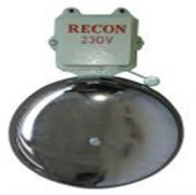
Fig. 7. Bell

An electric bell may be a mechanical or electronic bell that functions by means of an electromagnet. When an electrical current is applied, it produces a repetitive buzzing, clanging or ringing sound. Electric bells are widely used at railroad crossings, in telephones, fire and burglar alarms, as school bells, doorbells, and alarms in industrial plants, since the late 1800s, but they're now being widely replaced with electronic sounders. An electrical bell consists of 1 or more electromagnets, fabricated from a coil of insulated wire around an iron bar, which are a magnet for an iron strip armature with a clapper. When an electrical current flows through the coils, the electromagnet creates a field which pulls the armature towards it, causing the hammer to strike the bell.