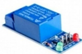
Fig. 4. Relay

Relays consist of three pins normally open pin, normally closed pin, common pin and coil. When coil powered on magnetic field is generated the contacts connected to each other.