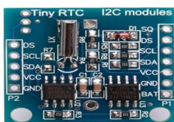
Fig. 3 .RTC