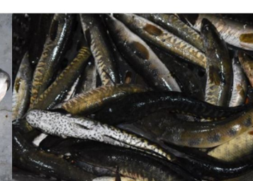
Channa striata (Hamilton, 1822)