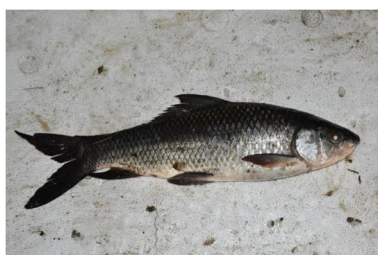
Labeo rohita (Hamilton, 1822)