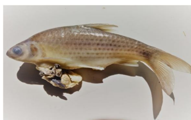
Puntius sophore (Hamilton, 1822)