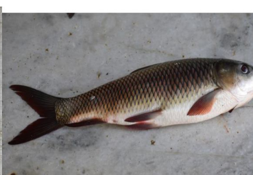
Catla catla (Hamilton, 1822)