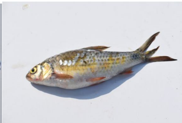
Labeo gonius (Hamilton, 1822)