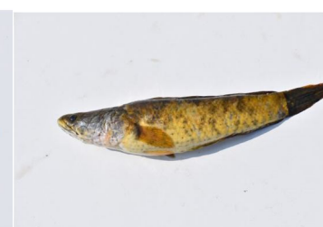
Channa punctatus (Bloch, 1793)