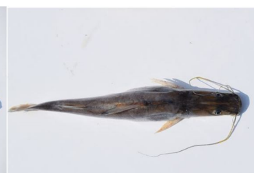
Mystus seenghala (Sykes, 1839)