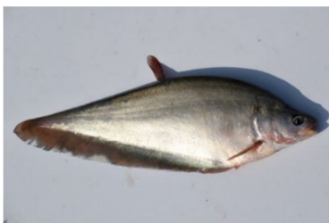
Notopterus notopterus (Pallas, 1769)