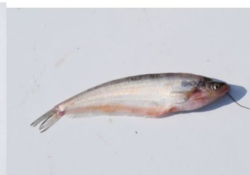
Ompok bimaculatus (Bloch, 1794)