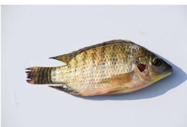
Oreochromis mossambicus (Peters, 1852)