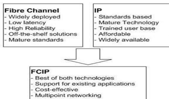
Figure 2: FCIP combines the best benefits of both IP and Fibre Channel technologies iFCP

iFCP (Internet Fibre Channel Protocol) is an ranging Fibre Channel storage crosswise the Internet and the network of emerging storage from fibre channel storage device to data passing. iFCP provides internet using TCP/IP or local storage area network conjunction with existing fibre channel protected are used or either iFCP can replace like FCIP (Fibre Channel over Internet Protocol).