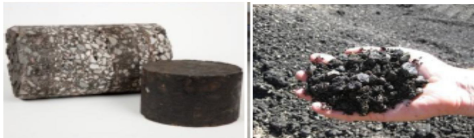
Fig.3 Core and Crushed Sample with RAP material

Upon selected RAP and Virgin aggregates to explore the feasibility of producing high-performance granular base/sub base layers that contain up to 30 and 35% RAP material. The main objective of the study is also find out suitability of Reclaimed asphalt pavement (RAP) materials to be used in construction of Flexible Perpetual pavements. This study was conducted to classify the RAP from Surface Recycling. RAP material obtained from different types of deteriorated bituminous pavement can be broadly classified as given in table.