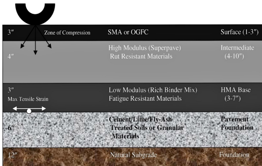
Fig.1 Typical Structural Section of Perpetual Pavement stress and strain distribution