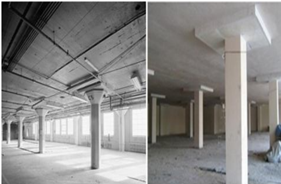
Fig. 3: Typical examples of flat slab