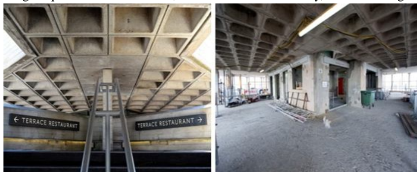
Fig. 1: Typical examples of waffle slab