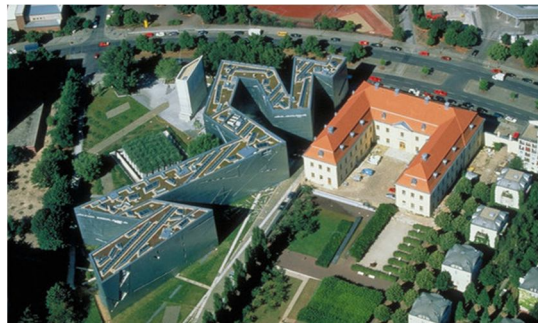
Figure 2: Jewish Museum (Rogers, 2020)

The inspiration of the shape was taken from star of David which is warped in shape. To symbolize the thousands of Berliners killed in the holocaust, a huge void has been created in the museum's form.