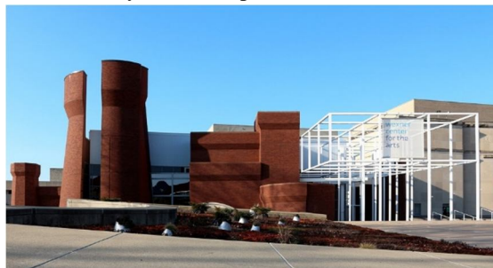
Figure 3: Wexner Center for the Arts (Web Urbanist, 2011)

Peter Eisenman, an architect based in New Jersey designed the first deconstructivist building located in American named Wexner Center for the Arts. This project was an experiment in the field of deconstructivism. It is a place for display of art but has been created in a dynamic way so that it appears as an art in itself. It is an open air five storey structure having a white grid work scaffolding like structure which has been intentionally left incomplete (Web Urbanist, 2011).