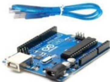
Figure.1. Arduino Uno

Arduino could also be a image platform (open-source) supported associate easy-to-use hardware and code. It consists of a board, which might be programed (referred to as a microcontroller) and a ready-made code known as Arduino IDE (Integrated Development Environment) that is utilized to jot and transfer the pc code to the physical board. Arduino Uno could also be a microcontroller board supported the ATmega328P (datasheet). it's fourteen digital input/output pins (of that 0.5 a dozen area unit usually used as PWM outputs), 0.5 a dozen analog inputs, a sixteen megacycle quartz, a USB association, academic degree influence jack, associate ICSP header and a button. It contains everything required to support the microcontroller; simply connect it to a pc with a USB cable or power it with Associate AC-to-DC adapter or battery to urge started.