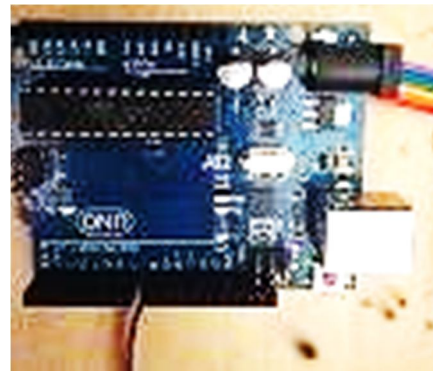
Fig. 3: Micro controller

A microcontroller is a compact integrated circuit designed to govern a specific operation in an embedded system. A typical microcontroller includes a processor, memory and input/output (I/O) peripherals on a single chip. A microcontroller is a small computer on a single metal-oxide-semiconductor (MOS) integrated circuit chip. In modern terminology, it is similar to, but less sophisticated than, a system on a chip (SoC); a SoC may include a microcontroller as one of its components. A microcontroller contains one or more CPUs (processor cores) along with memory and programmable input/output peripherals. Program memory in the form of ferroelectric RAM, NOR flash or OTP ROM is also often included on chip, as well as a small amount of RAM. Microcontrollers are designed for embedded applications, in contrast to the microprocessors used in personal computer or other general purpose applications consisting of various discrete chips.