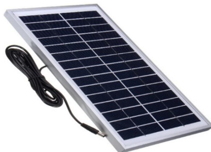
Fig. 6: Solar panel

Solar cells are used to make solar modules which are used to capture energy from sunlight. Because of earth rotation certain suitable tilting mechanism is to be adapted in congenial to the earth rotation to fall sun rays continuously on photovoltaic cell throughout the day. A dc motor has been used to tilt the solar panel.