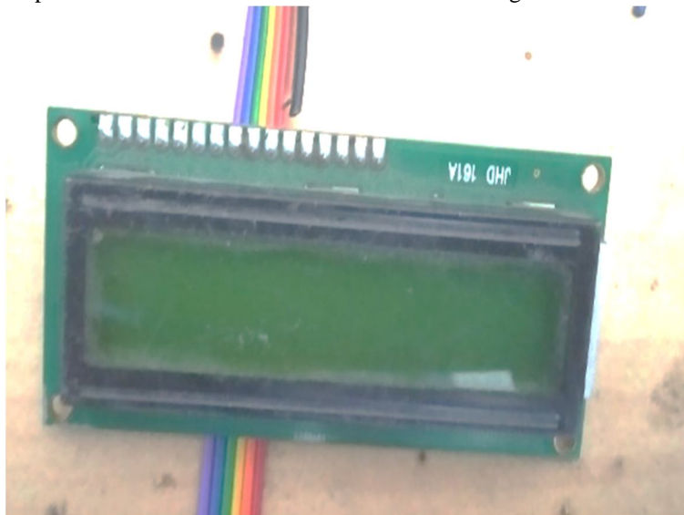
Fig .1: LCD display

A liquid crystal display (LCD) is a flat panel display or other electronically modulated optical device that uses the light-modulating properties of liquid crystals combined with polarizers. Liquid crystals do not emit light directly, instead using backlight or reflector to produce images in color or monochrome. LCDs are available to display arbitrary images (as in a general-purpose computer display) or fixed images with low information content, which can be displayed or hidden, such as preset words, digits, and seven segment displays, as in a digital clock. They use the same basic technology, except that arbitrary images are made from a matrix of small pixels, while other displays have larger elements. LCDs can either be normally on (positive) or off (negative), depending on the polarizer arrangement. For example, a character positive LCD with a backlight will have black lettering on a background that is the color of the backlight, and a character negative LCD will have a black background with the letters being of the same color as the backlight. Optical filters are added to white on blue LCDs to give them their characteristic appearance.