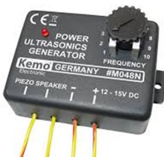
Fig .5: Ultrasound generator

The device that provides the electrical energy to power the ultrasonic transducers is known as the ultrasonic generator. Basically, the ultrasonic generator converts electrical energy received from the power line into electrical energy with the proper frequency, voltage and amperage. Ultrasound generator with sound transducer for generating a continuous ultrasound signal. The sound wave generated in liquids can be used for investigation of sound propagation and when a standing wave is set up, it is possible to demonstrate both light scattering and diffraction of coherent light rays at density transitions in the acoustic wave. This enables highly accurate determination of the speed of sound in the liquid. And it is known as the ultrasonic sound generator.