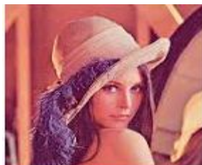
Fig. 4 Sample Input Image