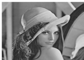
Fig. 1 Input image: