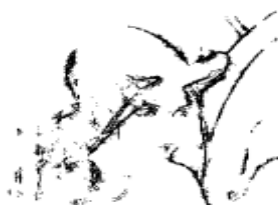
Fig. 2 ( q_0 ) = 0.0 (Output image when q_0=0.0 )