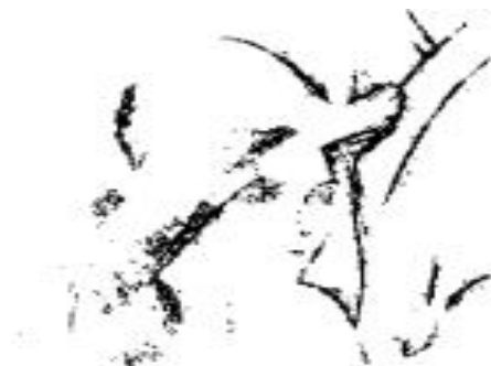
Fig. 3 ( q_0 = 0.1 ) (Output image when q_0=0.1 )