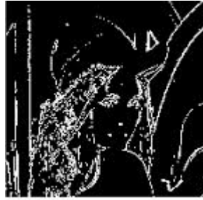
Fig. 5 quality edges obtained using PSO proposed method (optimal solution)