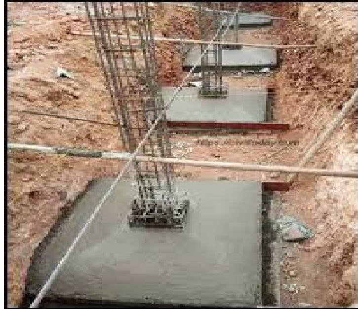
Fig. 2: Typical Foundation

Depending on the depth of load-transfer from the structure to the ground, foundations are classified as shallow and deep foundations. The definition of shallow foundations varies in different publications. The subject of bearing capacity is perhaps the most important of all the aspects of geotechnical engineering. Loads from buildings are transmitted to the foundation by columns, by load bearing walls or by such other load-bearing components of the structures. The two basic criteria to be satisfied in the analysis and design of a shallow foundation are stability and deformation requirements.