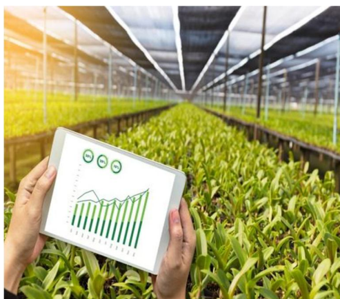
Figure 1: Analysis of data in field monitoring

Using block chain technology agriculture process goes on smoothly, each keeping a food supply chain on demand the process is connected on network it means drones and tractor are connected using device id and track the device and the process goes on smoothly [1]. Small hold farmers are also gets benefited using the smart agriculture process using Block chain technologies' benefits for farmers might be dependent on the size of the farm. On the one hand, smaller farms could easily participate in a block chain-based production on market. In this smart agriculture, we use Block chain technology for network connectivity control the drones and tractors from where ever we are each and every and control the devices without lack of network for the following process such as, Land preparation, Crop yielding, maintaining soils water level, Pesticide for plants, Harvesting [6]. On the opposite hand, grouping and desegregation on farm knowledge and smart electronic device usage knowledge could be additional convenient for large farms. Thus, further research should try to anticipate which farms could benefit an which could lose from the introduction of block chain-based solution [2].