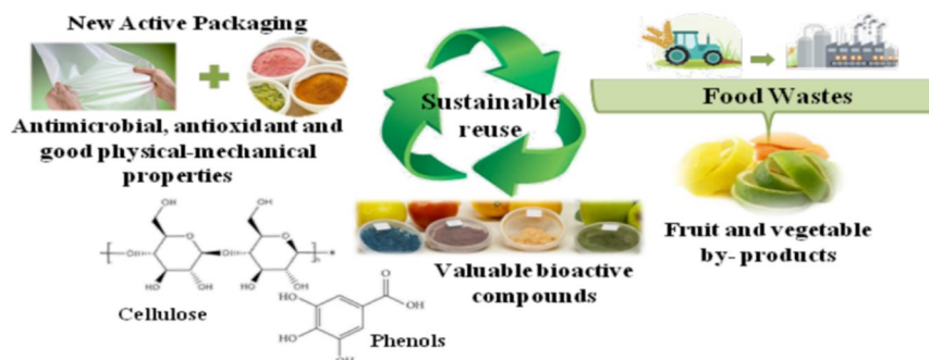
Figure 2: Sustainable use of fruit by-product to enhance the food packaging performance