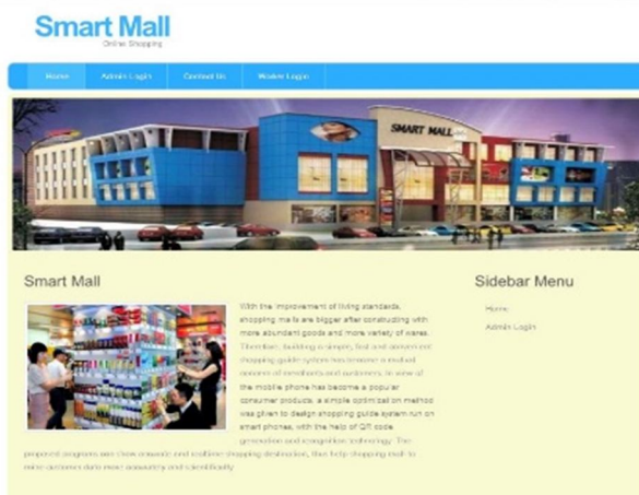
Fig2. Main page of system

This system is convenient because it uses UI (User Interface) to the customers on their android phone. So that user can add, view and delete the products on their own from shopping cart. Also, user get to know about offers as well as references of particular products. After finishing the shopping, user get the packed shopping bags at the billing counter, so by doing quickly online or offline payment user can leave the shop instead of weighting in the long queue to pay the bill.