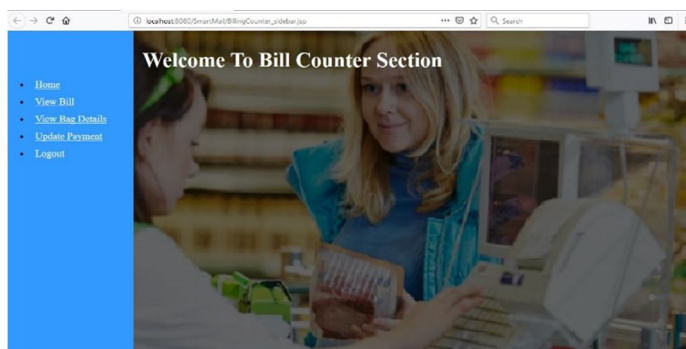
Fig5. Billing Section