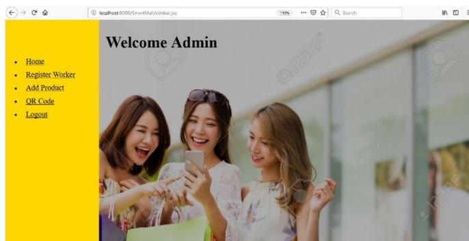
Fig3. Admin Section