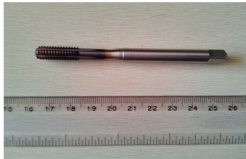
Figure: 2 Tapping Tool