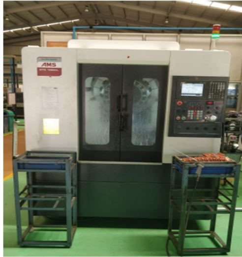
Figure: 1 Vertical Milling center