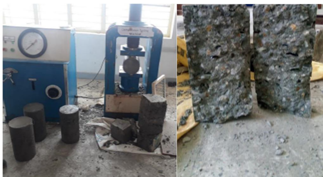
Figure 2: Split Tensile Strength setup and splitted sample