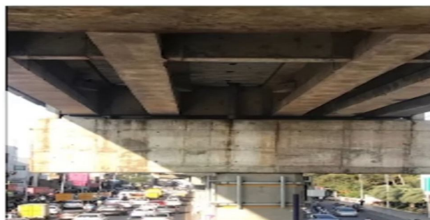
Fig 2: shows the a real bridge structure which is prone to carbonation attack.

Structures. The Sheltered structures are more prone to carbonation attack than that of unsheltered structures since the fact is that humid environment more prone to carbonation corrosion than dry environment similarly sheltered structures environment will be like humid therefore it favors carbonation corrosion whereas unsheltered structures which are open to sun therefore dry environment are less prone to carbonation corrosion .