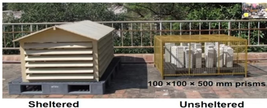
Fig 1: shows effect of carbonation in sheltered and unsheltered (open to sun)

Day by day the CO 2 emission increases which is become more concern topic. The emission of CO 2 from vehicles, construction industry, burning of waste, industries etc. The urban structures present in other than coastal areas are more prone to CO 2 attack. Structures in coastal areas also do attacked by carbonation. carbonation in reinforced concrete structure destroy the passive layer of steel by reduction of alkalinity of the concrete this leads to initiation of corrosion of concrete. Figure 3 compares the carbonation effect through a typical sheltered and unsheltered