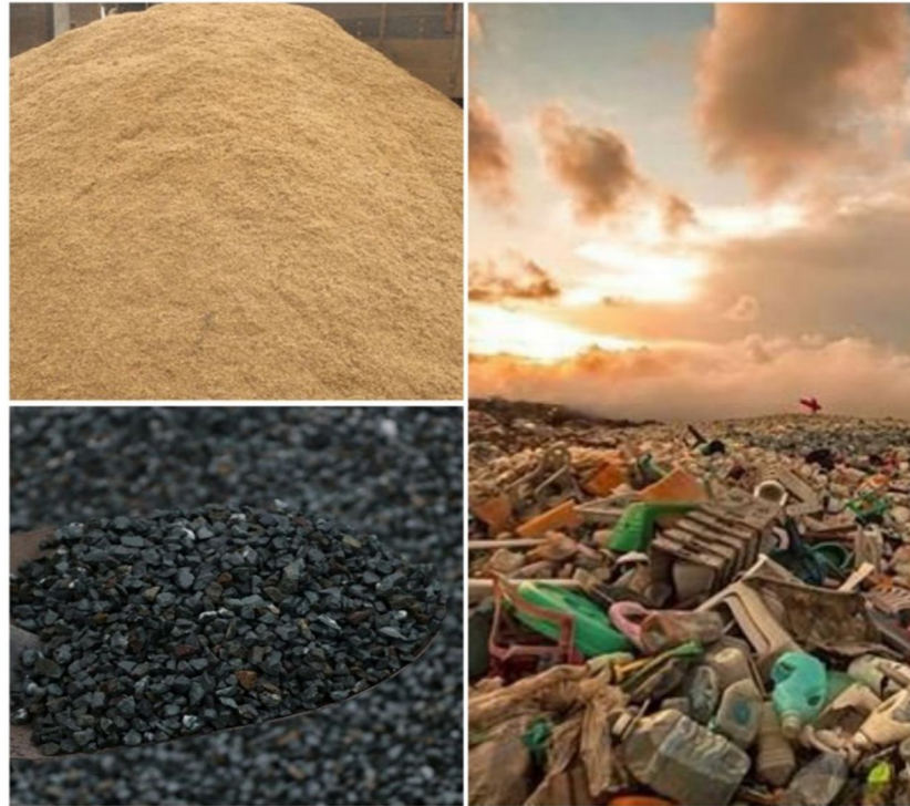
Table I. Properties of materials