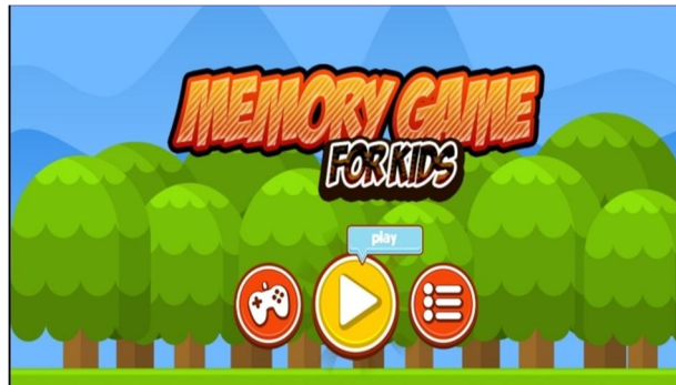
Fig 4. User age above 18

The above figure (Fig 3.) shows the home page of this system where the image input has been recognized the user age can be above 18 or below 18.