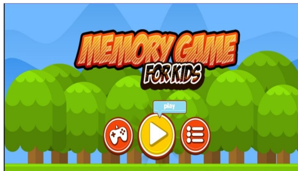
Fig 4. User age above 18

The above figure (Fig 3.) shows the home page of this system where the image input has been recognized the user age can be above 18 or below 18.