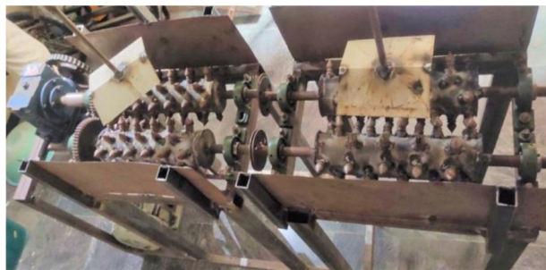
Figure 1. Fabricated model.

After making a solid model of machine as per the model different components of coconut dehusking machine are fabricated. The frame is the main supporting structure upon which the other components are mounted on. The frame is a welded structure constructed from 50mmx50mmx5mm angle iron with dimensions 720mm in length, 330mm width and 810mm height. The electric motor mounted bottom of the frame and the chain drive is used to transfer the power to the reduction gear box. The reduction gear box is attached to the rollers shaft. The unit comprises of 2 rollers and 2 roller shafts. The another unit comprises of 2 rollers and 2 rollers shaft are attached when it is required. Each roller shaft is a mild steel rod of 76mm diameter with length 300mm supported at both ends by pillow block bearings. Two gears mounted on the shaft with 50teeth the driver gear rotates driven gear. Spikes welded on the roller, distance between two spikes is 30mm and 6 spikes welded on periphery of the roller at 90° angle. Total 48 spikes welded on one roller. Selection of above specifications is done on average diameter of the coconut and forces acting in vertical and horizontal plane.