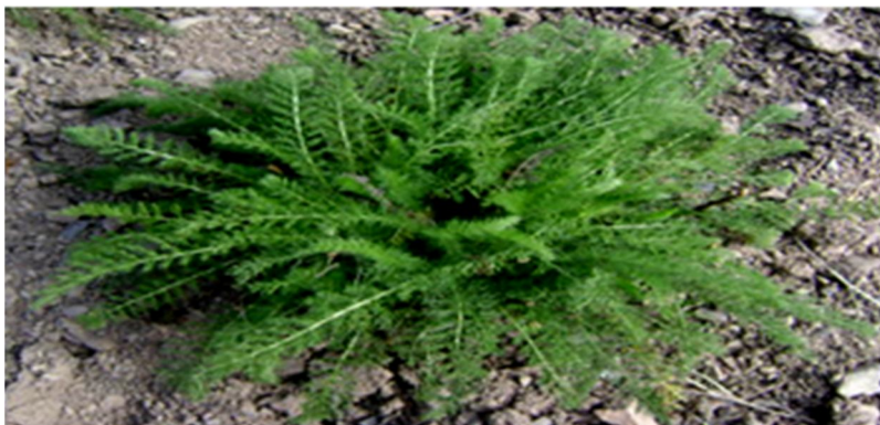
Figure I: Achillea millefolium : An important medicinal plant