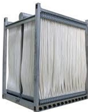
Figure 3: Membranes in MBR