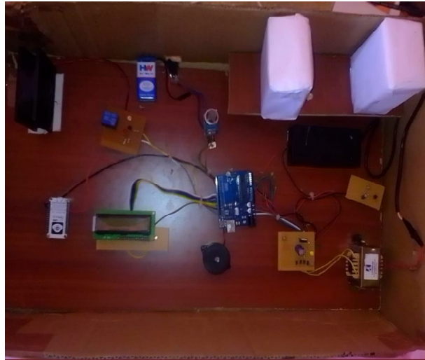
Figure 5. Overall view of the system

This temperature sensor is measured by room temperature. If room temperature is abnormal condition automatically fan and buzzer alert in this system.