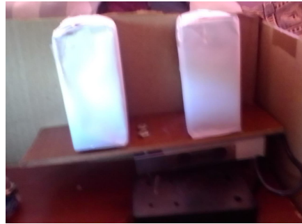
Figure 1. Load Cell Measured

Calculated the weight of the cylinder. Applying the various of weight. All weights are measured and values are display in the LCD display.