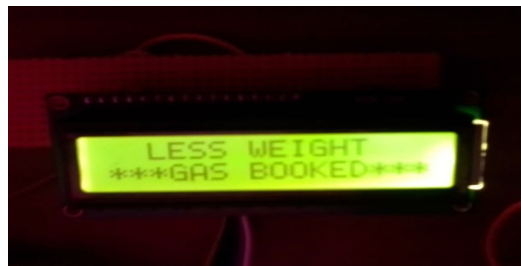
Figure 2. Gas Booked

If weight of the gas cylinder is less automatically booked the gas cylinder