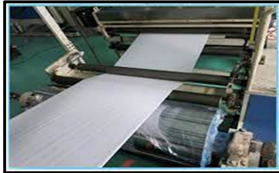
Fig ii: Paper coated with LDPE

Low-density polyethylene (LDPE) is a thermoplastic made from the monomer of ethylene and it is used for linings of paper cups which help them to retain the original shape irrespective of temperature of liquids they hold. Once these paper cups are made they have an expensive process of recycling to separate Ldpe and paper hence it is necessary to analyse the waste that can be generated during the manufacturing process and use techniques to reduce it substantially. Generally paper which is the basic raw material for manufacturing paper cups is pre-coated with the lining and does not require an additional machinery to coat the paper with these linings.[1]