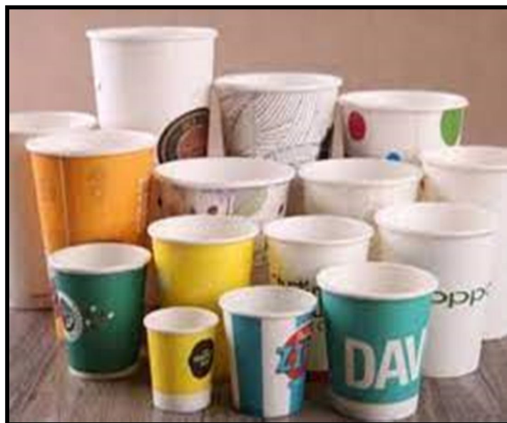
Fig i: Papercups in varied sizes and shapes

Paper cups are widely used and to stop the passage of liquid from a Paper cup, it's typically coated with plastic or wax. Paper cups are factory-made from recycled paper and have varied uses round the world. in an exceedingly astronomically immense cull of customs and gregarious categories their main use is to serve beverages or water.[3] Paper cups have different distinctive appearances, sizes {and styles/ and styles} with every style of design having Associate in Nursing supposed purport looking on the scarcely liquid they hold and on occasions they're utilized. Some ornamental patterns on paper cups are utilized at special events or celebrations to accommodate alcoholic beverages like cocktail, liquor and wine. In things wherever crockery is out of stock or it's a time constrain, it leads to use of paper cups in restaurants. Image exhibiting the variants of designs of paper cups is shown in figure.[7] In the Paper cup engendering trade, Paper cups are composed of a series of assorted processes looking on the sort and additionally the supposed utilization of the paper cup[8]. Initially all disposable cups that embrace Paper cups are composed of a Paper cup engendering machine by alimenting an oversized roll of paper that is inscribed so withdraw minuscule items that are fixed into the machine and bear a series of processes to supply a paper cup as the final product which can be employed in consummately different places.