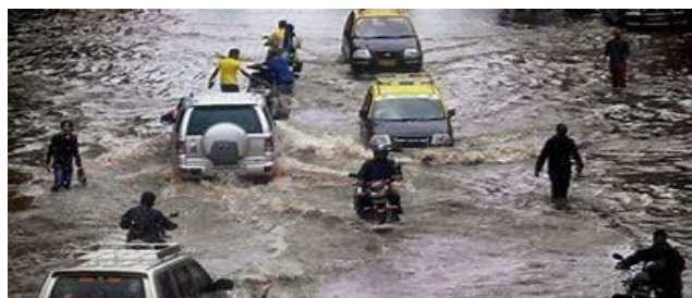
Figure 1.2.2: Flooding Effects

As indicated by environment researchers, ocean level ascent is "Perhaps the main effects of worldwide environmental change." Sea level has been ascending in the course of recent years, and a dangerous atmospheric deviation is required to build the yearly rate by two to multiple times.