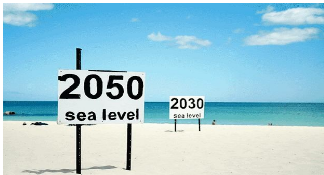
Figure 1.2.1: visible change in costal lines

Environmental Change: A Global Crisis Our reality is definitely evolving. Inside the recent years, environmental change has become a developing concern around the world. The different methods of obliteration forced on our current circumstance are focused to be the impetus to these changes. A significant expansion in tropical storm action, observable variances in temperature, and a convergence in CO2 discharges have all been noted worries for some. One of the essential feelings of dread originating from a dangerous atmospheric deviation is that not exclusively will climate designs become more extreme and capricious, yet our seas will rise and annihilate our coastlines, structures, homes, and networks around the world.