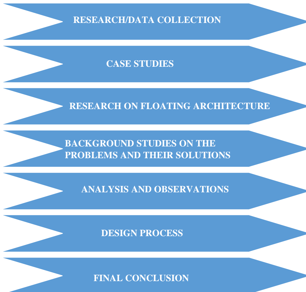
Figure.4.5.1: Method (Author)

After selection of project, it is important to make the method which can help me out to the right direction and lead me to the understanding and designing of the project. So, me into given below sequence;