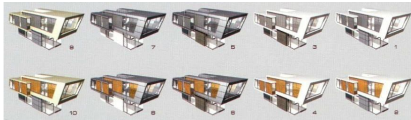
Figure III.1.2: Tree house school section