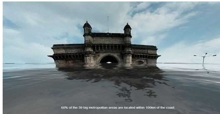
Figure.4.6.1:Image of Gateway of India during a flood in Mumbai