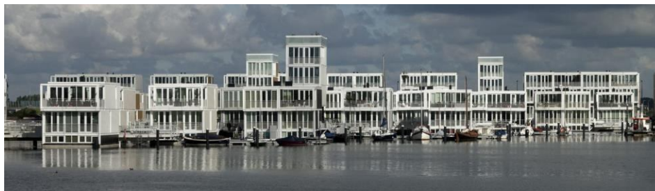
Figure 6.2.1: Side view of the housing