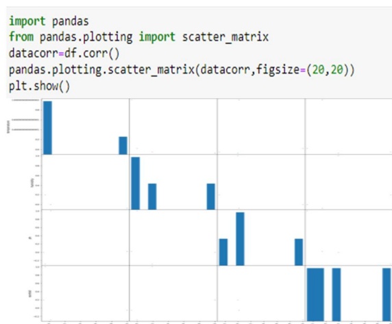
Fig. Correlation Matrix plot diagram

Implement a system to predict crop production from the collection of past data. Using machine learning techniques crop yield is predicted. Here, using Random Forest algorithm for predicting the best crop yield as output. In agriculture field, the crop yield prediction is mostly appropriate. The more increase in accuracy results in more profit to the crop yield. The proposed technique helps farmers to acquire apprehension in the requirement and price of different crops. It helps farmers in decision making of which crop to cultivate in the field. The more increase in accuracy results in more profit to the crop yield. This work is employed to search out the gain knowledge about the crop that can be deployed to make an efficient and useful harvesting. Under this system, maximum types of crops will be covered. The accurate prediction of different specified crops across different districts will help farmers of India.