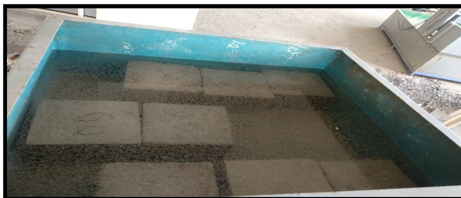
Fig 3.3: Curing of cubes

8) Curing the cubes in cold water for 24 hrs.