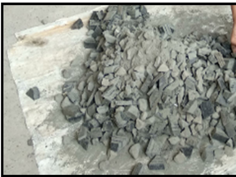
Fig 3.1: Dry Mixing