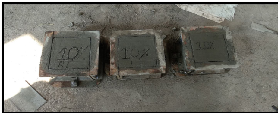
Fig 3.2: Casting of cubes

7) Then casting the cubes in 150 ×150×150mm mould