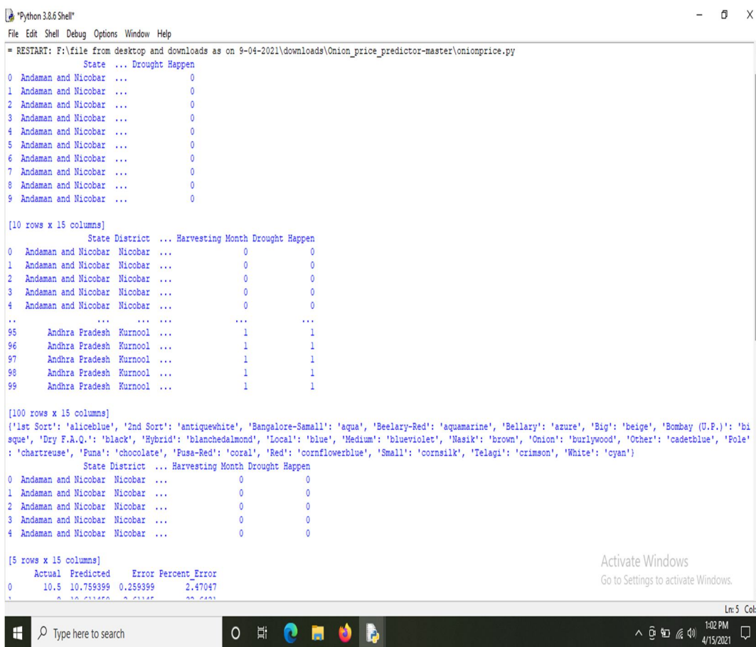
Figure 4.1: loading datasets

In this section, result of our proposed work is discussed and it comparison with other available algorithms are shown and discussed clearly. Initially dataset loading is shown in below figure 4.1.