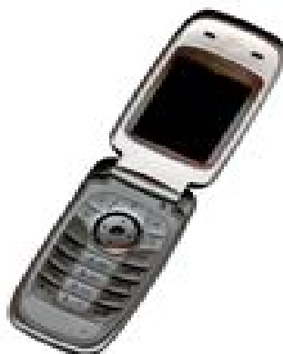
Fig. 2 Example of an unacceptable low-resolution image

Figures must be numbered using Arabic numerals. Figure captions must be in 8 pt Regular font. Captions of a single line (e.g. Fig. 2) must be centered whereas multi-line captions must be justified (e.g. Fig. 1). Captions with figure numbers must be placed after their associated figures, as shown in Fig. 1.