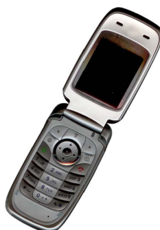
Fig. 3 Example of an image with acceptable resolution