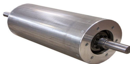
Fig. 6 Pulley