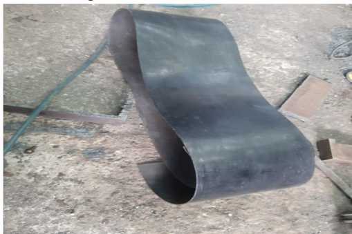
Fig.5 Polymer Belt