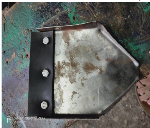
Fig.8 Polyurethane Blade