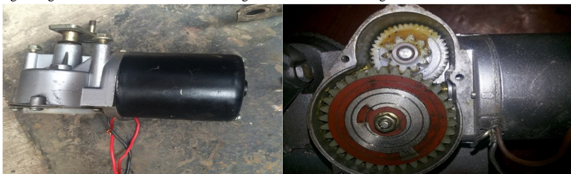
Fig.4 DC Motor